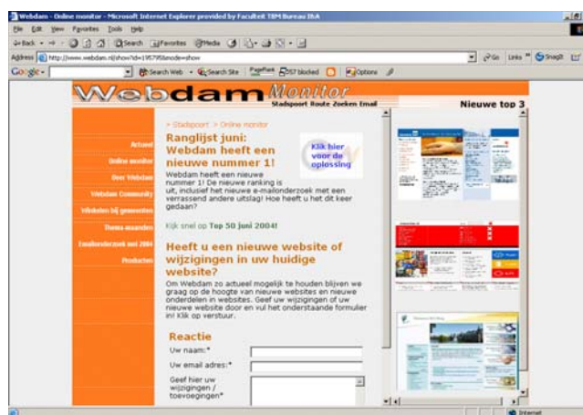
Figure 4: Screenshot of webdam

Each group has a minimum and maximum score. The total is aggregated to determine a ranking. •Who determines score?